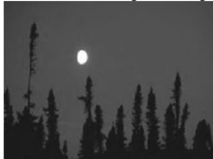
(a) Scenery image before segmentation

Experiments are conducted on Intel(R) Core i5 2.50 GHz CPU with a RAM of 4.00 GB. We select two images as experimental images, use the proposed algorithm compared with traditional reinforcement learning image segmentation algorithm. The images both before and after the segmentation are shown in Figure1 and Figure 2.