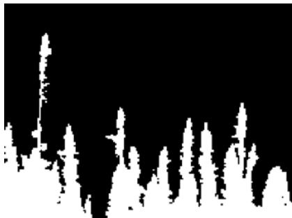
(b) Scenery image after segmentation