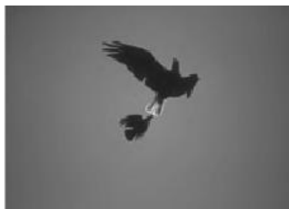
(a) Sky and birds image before segmentation