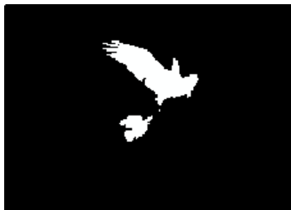
(b) Sky and birds image after segmentation